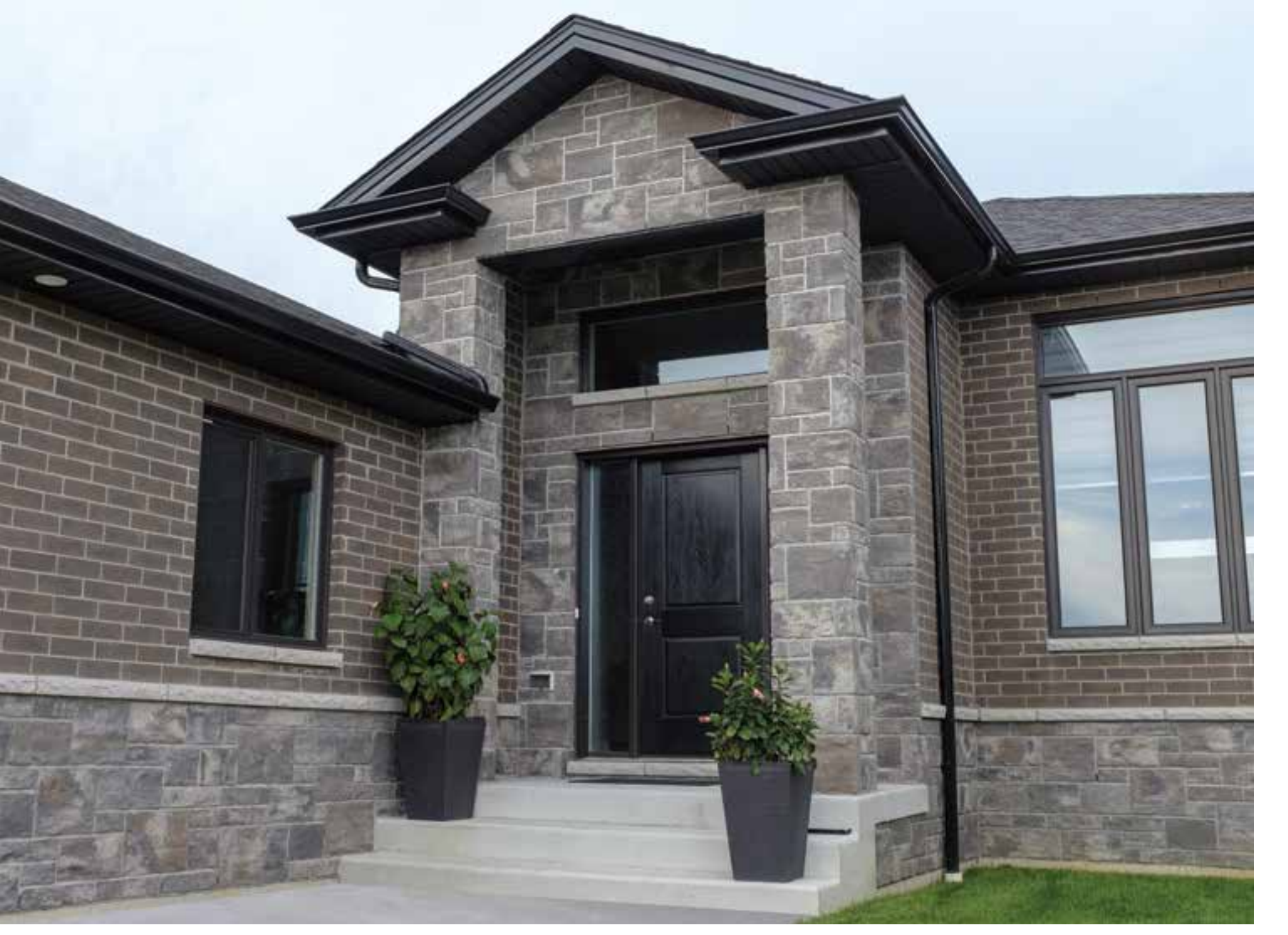
CANTERBURY STONE - MUSKOKA GREY / CHELSEA MATTE BRICK - ASHWOOD