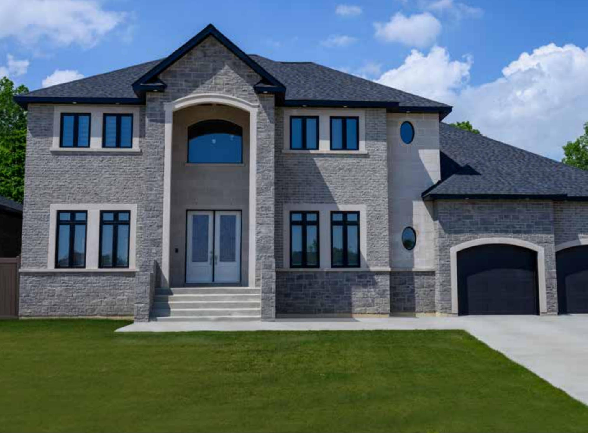
DURHAM ROCKED BRICK - MISTY GREY / CANTERBURY STONE - NEW CASTLE GREY