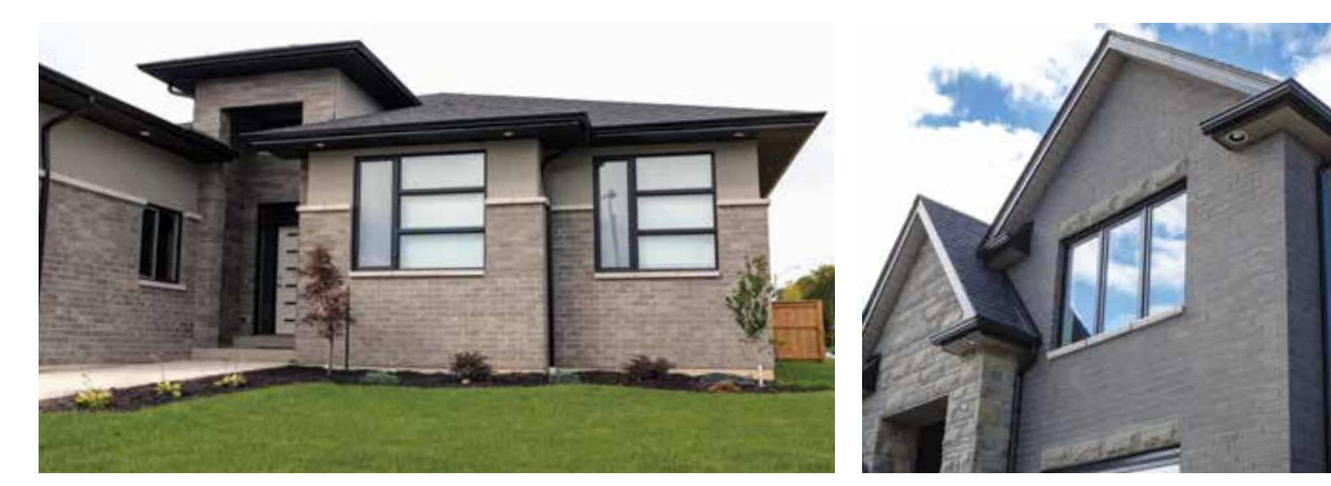
CHELSEA MATTE BRICK - SILVERSTONE