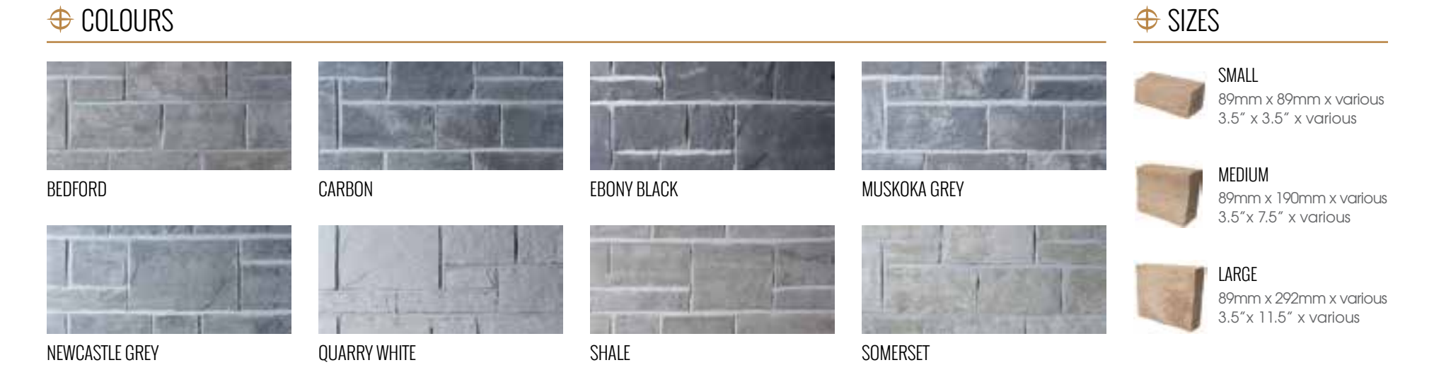
CANTERBURY STONE - BEDFORD