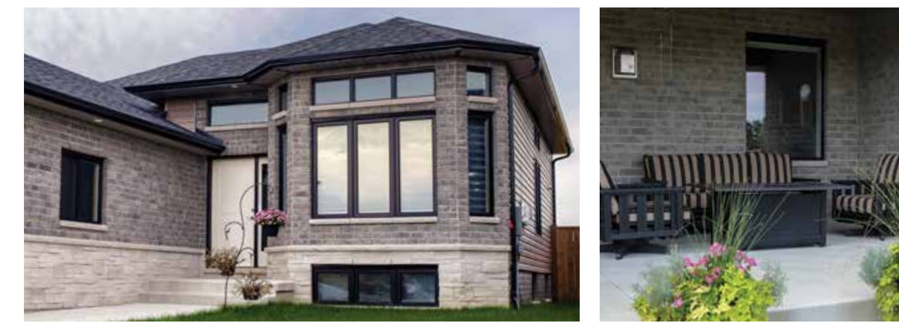
OXFORD BRICK - NEWCASTLE GREY