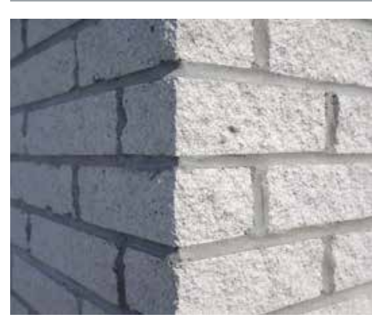
CHELSEA MATTE BRICK - MISTY GREY / CANTERBURY STONE - NEW CASTLE GREY