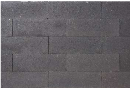
EBONY BLACK SMOOTH