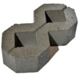
Earth Stone with Fortress Wall Greystone